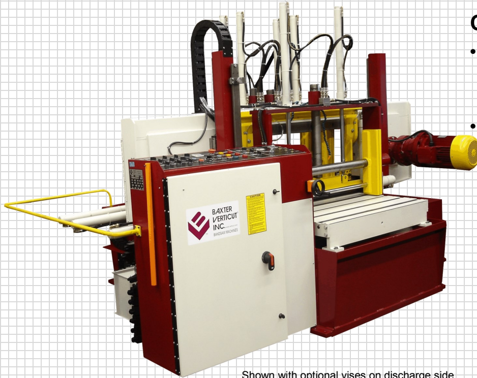
Shown with optional vises on discharge side